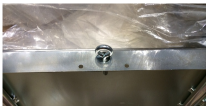
A pin keeps the bin attached to the trolley